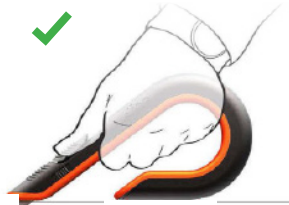
Slice box cutter Hands protected